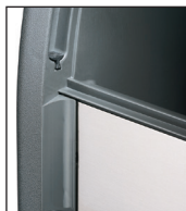
Routine Maintenance Alarm